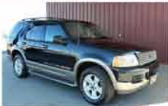
'03 FORD EXPLORER