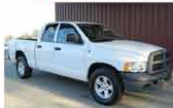
'05 DODGE RAM