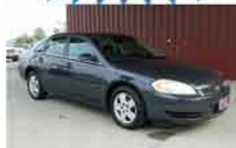
'08 CHEVROLET IMPALA