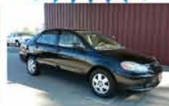
'05 TOYOTA COROLLA