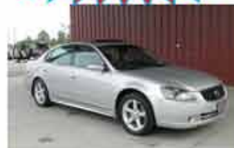
'05 NISSAN ALTIMA