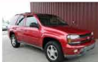
'05 CHEVROLET TRAILBLAZER