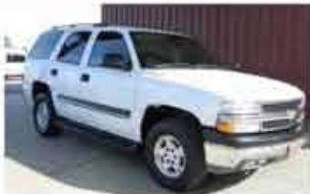
'04 CHEVROLET TAHOE