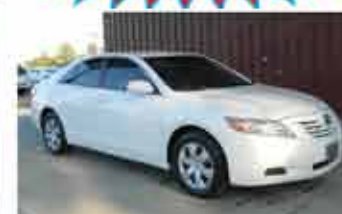
'07 TOYOTA CAMRY